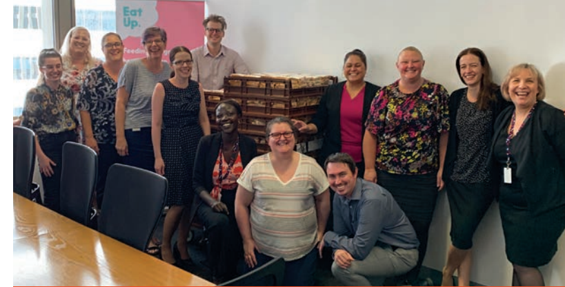
Above: The Brisbane office participating in the Eat Up Challenge

“When I signed up for workplace giving I decided to stop my other occasional donations because giving through my pay was easier. I've loved being able to be involved in such a great cause and the way everyone in the firm became involved in the annual Pyjama Day – it was a really fun way to raise funds and help.”