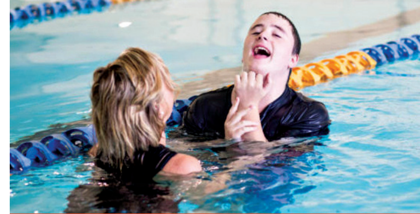
Above: Autism Swim (AS) are international Water Safety and Swimming Specialists

The Foundation, as always, will continue to remain agile and flexible to harness the energy of and goodwill of our people, providing indispensable support for disasters and crises affecting the community.