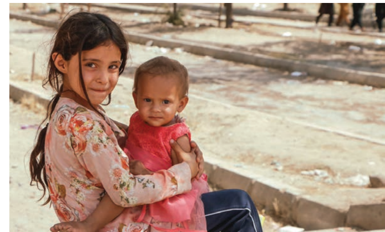
Above: Mahbobas Promise, an Australian non-profit organisation dedicated to helping disadvantaged women and children in Afghanistan

Sub-funds established by Macpherson Kelley's clients sit within this structure. Compliance, administration and financial management are handled by the Foundation. Clients get to contribute funds, as they decide, and, subject to the approval of the Trustees, select (or choose) where their funds are donated (in accordance with charitable rules).