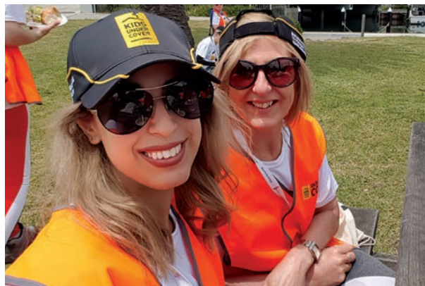
Above: Helping out with Kids Under Cover